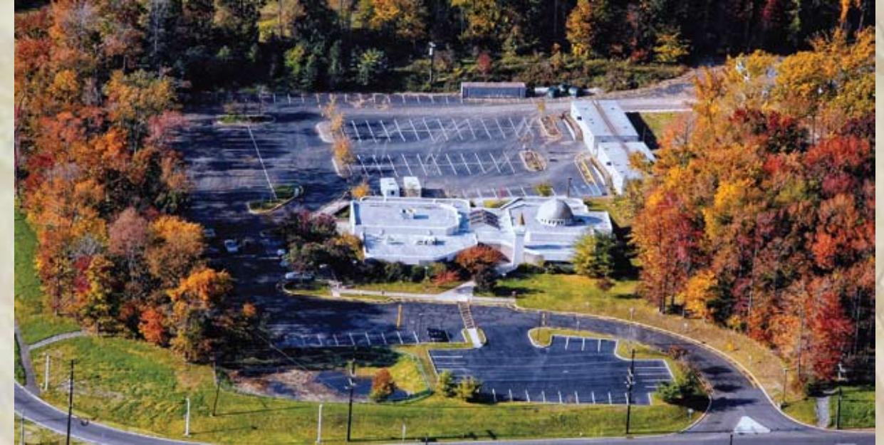
Aerial view of our Existing Property Showing the Mosque and part of the School in Modular Units